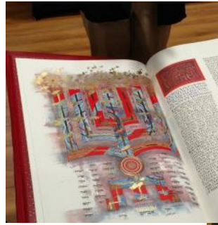
The No Limits group enjoyed their guided tour of the St. John's illuminated Bible last week.