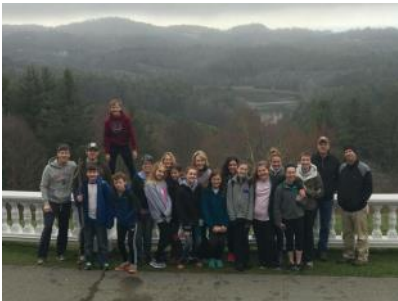
Scenes from last year's retreat

Students and mentors will spend time sharing with one another and growing together, take a hike at Moses Cone State Park, roast s'mores and watch the movie To Kill a Mockingbird as we try to grow in faith and to one another. Participants will make a banner representing the theme of the weekend (watch for pictures in an upcoming edition.)