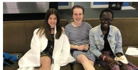
Easter Sunday Worship Leaders

August 11-14 – Middle School Local Mission Trip