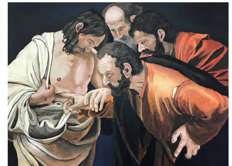
THE INCREDULITY OF SAINT THOMAS

Copies of worship bulletins are available on the St. John's website: stjohnsbaptistchurch.org