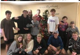
Middle and High School Youth Mission Christmas Parties 2018