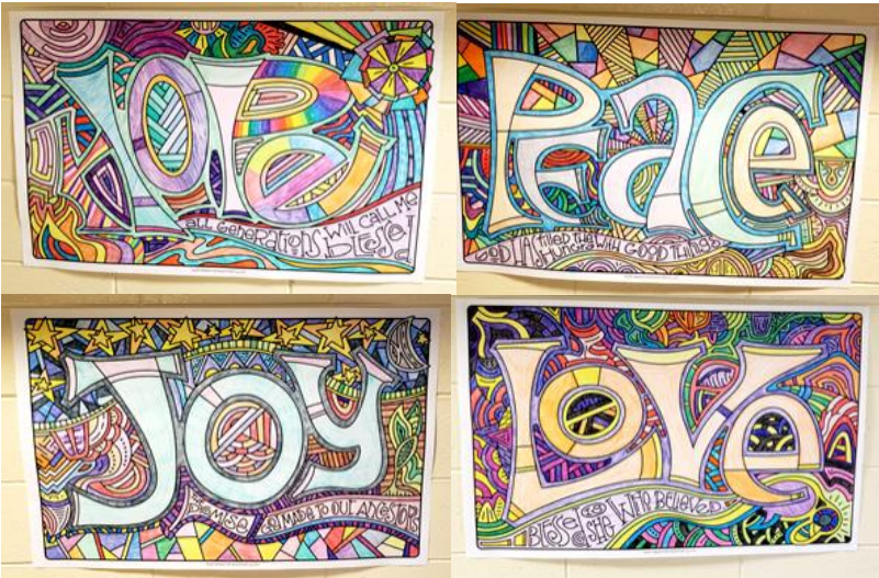
Advent Coloring Posters for 2018