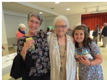
Check out more pictures on Facebook and Instagram!