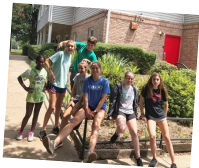
Charlotte Family Housing