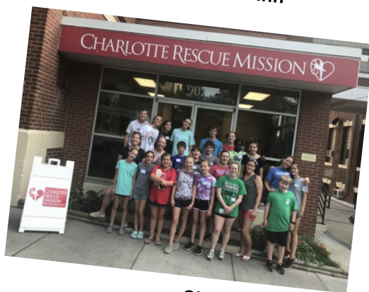
Charlotte Rescue Mission