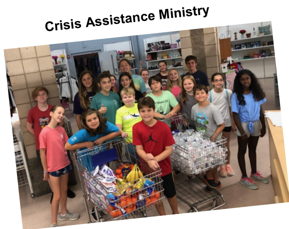
Crisis Assistance Ministry