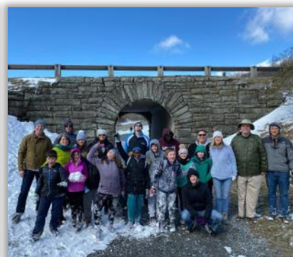
Middle School Discipleship Retreat to Blowing Rock February 28-March 1, 2020