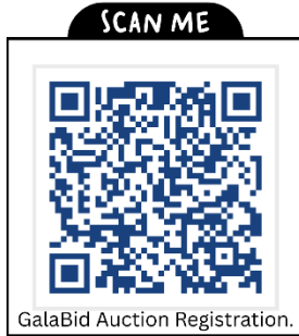
GalaBid Auction Registration.

This year's Youth Mission Auction will be held on April 19, 2026 in Broach Hall. BBQ Lunch tickets are $20 for adults. Lunch is free for children 12 & under. Childcare will be provided.