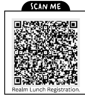
Realm Lunch Registration.

If you plan to attend in person you need to register BOTH on Realm for lunch and on GalaBid for the auction itself.